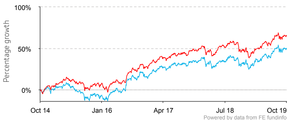
■ Scottish Equitable Aberdeen Life World Equity ■ ABI Global Equities

In the graph, performance is shown since launch if the fund is less than five years old.