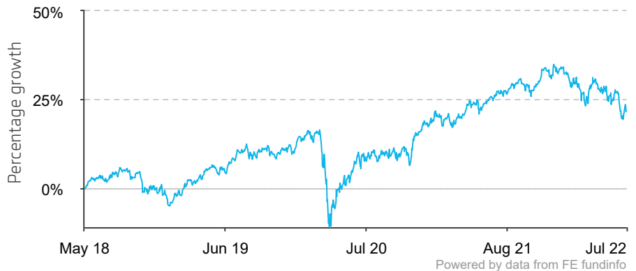
■ Aegon Workplace Default (ARC)

In the graph, performance is shown since launch if the fund is less than five years old.